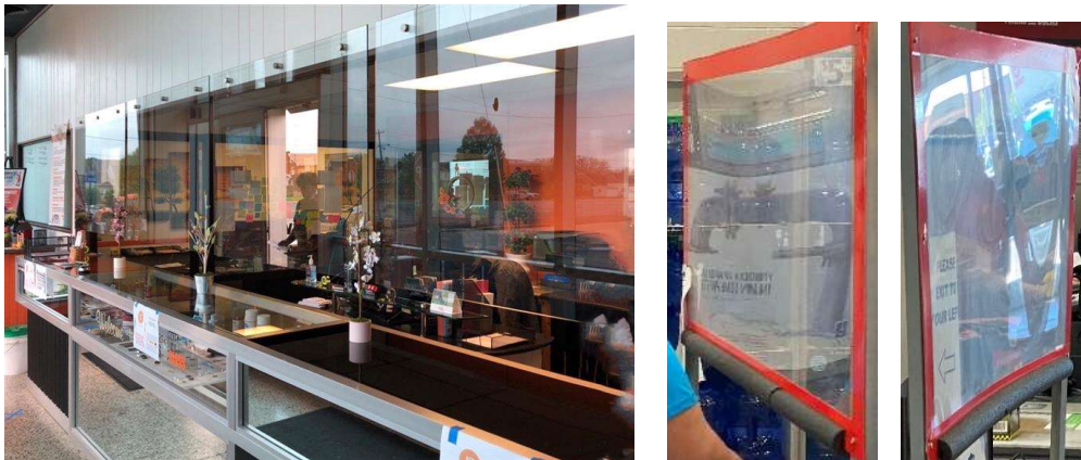
Figure 1: Safety glass installed for personal protective barriers (left photo) can provide a sleek, professional, sanitary, yet welcoming feel for consumers entering retail stores compared to plastic barriers (right photo) where rough edges and hazy distortion combined with surface scratches detract from the consumer experience and collect dirt and potentially bacteria.

Retail, medical, educational and manufacturing facilities are implementing changes due to the worldwide outbreak of COVID-19, a respiratory illness believed to spread primarily by droplets from coughs or sneezes of infected persons to those nearby. Many businesses are installing clear personal protective barriers to physically shield employees from each other and from consumers to reduce potential exposure to the virus. In many applications, the barriers will become a permanent fixture; therefore, aesthetics and cleanability are important design considerations. Barriers can be constructed of plastic sheet or glass. Glass has several advantages in physical barrier applications and may be preferred over plastic, especially for permanent and public-facing barrier installations. Compared to plastic, glass is easy-to-clean, transparent and aesthetically-pleasing.