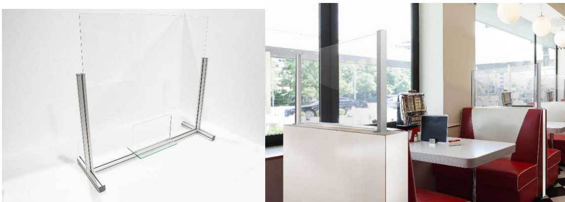
Figure 2: Examples of glass barriers mounted with edge clamping supporting two or more edges.

Edge clamps and adhesives are examples of simple and efficient ways to mount glass panels without designing and drilling holes into the glass. Using this technique, the mounting components should support the glass along a minimum of two edges and bite depth of the edge clamping over the glass edge should be appropriate for the glass thickness (see figure 3), as specified in the Glazing Manual and Laminated Glazing Reference Manual . Hardware is readily available for glass guards to support the weight of the glass panel without crushing or locally stressing the glass surface.